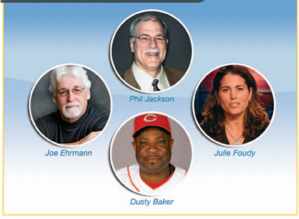
A screen from the Double-Goal Coach course.