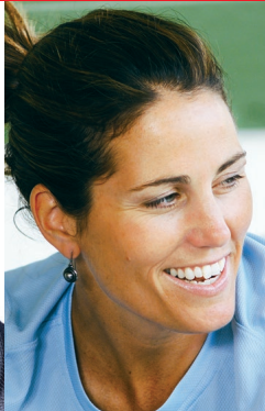
JULIE FOU DY